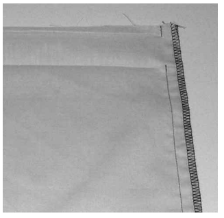
4) Stitch to casing upper edge and backstitch. Skip to casing lower edge, backstitch and stitch the rest of the seam.

An in-seam opening allows you to stitch the entire casing closed. The elastic is inserted through the open part of an intersecting seam. The pattern should have markings for the opening, usually in the center-back seam. When stitching the intersecting seam, begin at the casing upper edge, and stitch to the first mark; backstitch. Skip to the next mark, backstitch, and sew the remaining portion of the seam (4). Fold down the casing, and stitch the entire casing along the lower edge. Insert the elastic through the opening of the seam (5). Close the opening with a slipstitch or whipstitch (6).