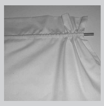
3) Curtains that hang from a casing usually have a wide heading.

A heading is extra fabric at the upper edge of a casing. A narrow heading makes a crisper edge. A wider heading creates a ruffle; these are often seen on feminine curtains, skirts, pants or shorts. To create one, add the necessary additional amount to the casing width, add a second row of stitching the desired distance from the casing upper edge (3).