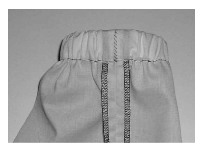
6) Whipstitch opening closed.